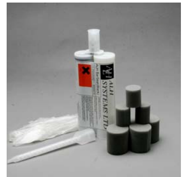
Spare nozzles and foam are also available.