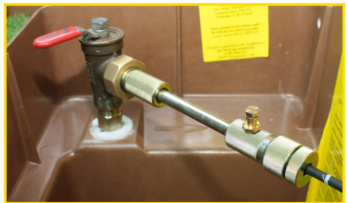
ECVs ready for exchange in operational (left) and demo (right) meter boxes.