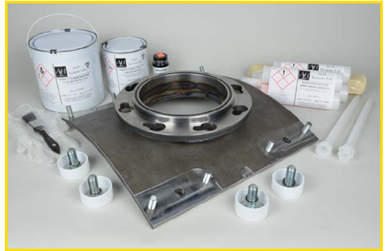
Complete Bond & Bolt saddle kit