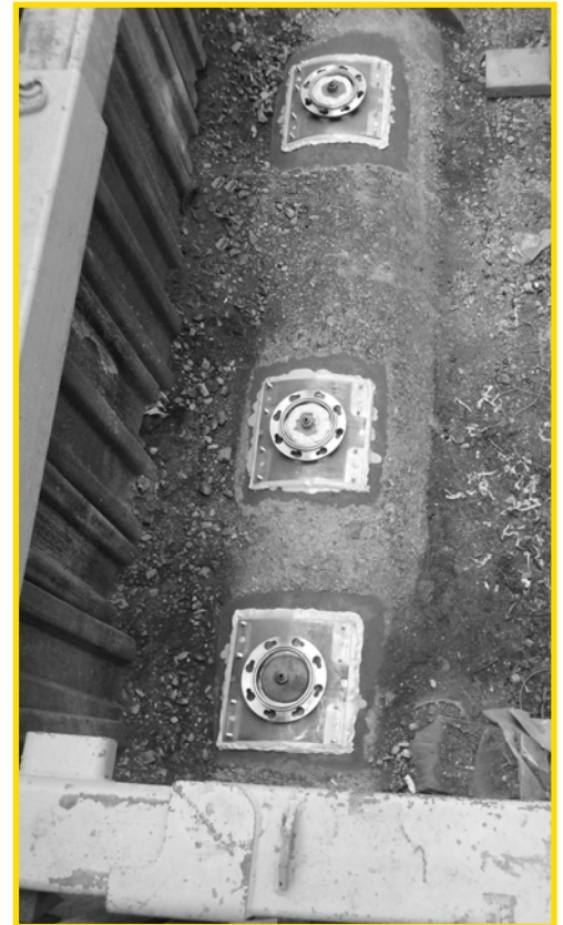
Bond & Bolt Saddles, Wandon Road, Fulham, 2016