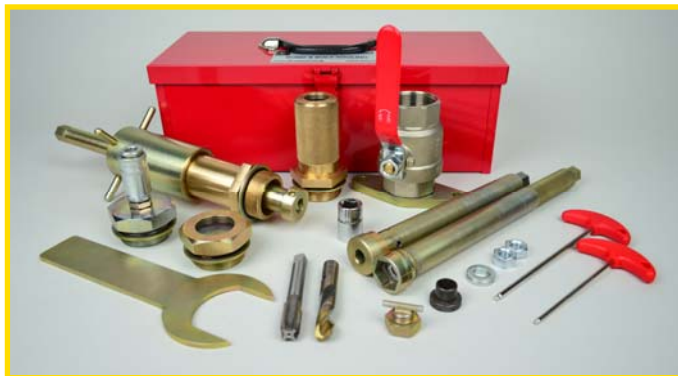
Bond & Bolt complete drilling kit Part Number: 119-9018

ALH Systems Ltd offer full training to clients with existing equipment and when new equipment is purchased.