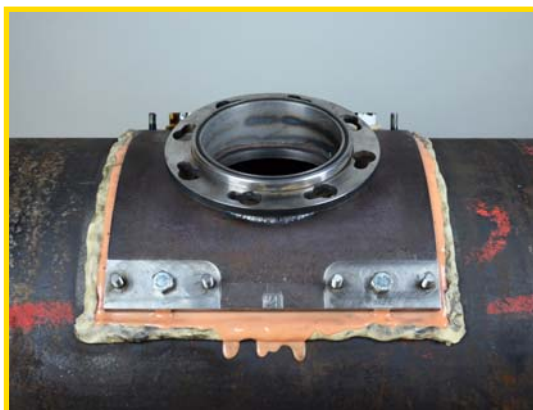
24" Bond & Bolt saddle This is an exhibition piece and can be viewed at ALH Systems